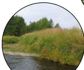
Reed Canary Grass