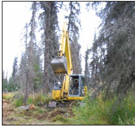
Figure 5: Buck Jones of East Road Services uses an excavator to widen a section of the trail.