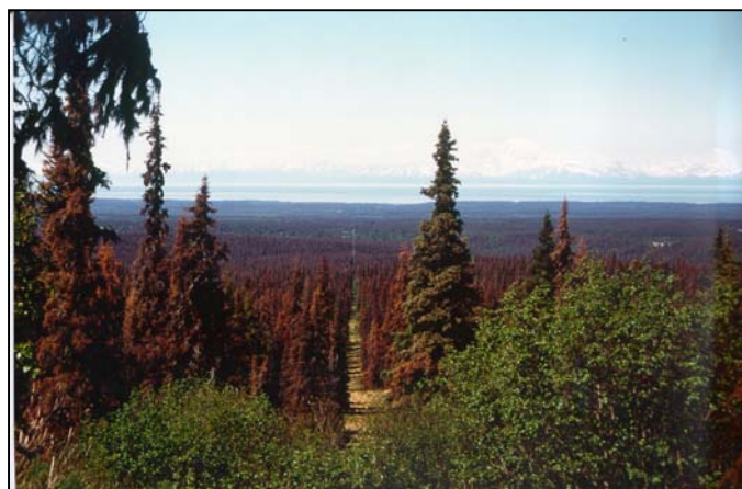
Figure 7: This photo illustrates the impact of the spruce bark beetle infestation.

The Spruce Bark Beetle Epidemic has caused widespread devastation in mature Alaskan spruce forests. As the spruce trees affected by the epidemic die and decay, the soundness of local timber increasingly is an issue. Future projects need to examine the quality of local spruce stands to determine project viability. The increasing scarcity of sound local timber also poses a threat to ongoing Caribou Lake Trail maintenance. Stockpiling boards now for future maintenance can mitigate this issue.