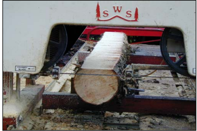
Figure 3: The sawmill used by Homestead Endeavors to mill planks for the Caribou Lake Trail Project.