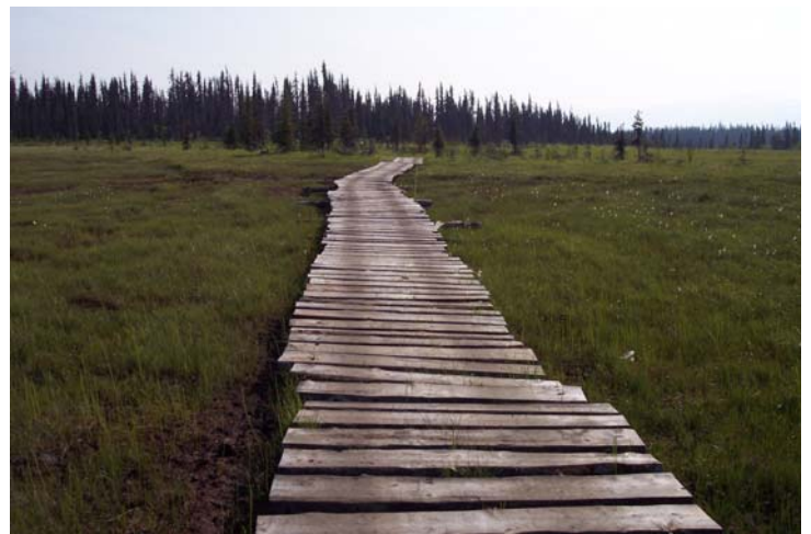
July 22, 2004