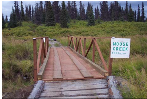
Figure 6: District consultant Hans Klausner and trail crew leader Seth Ex constructed railings and decking on the bridges in August 2004.