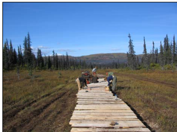
Figure 2: The District Trail Crew and volunteers construct the boardwalk using a modified design of the method pioneered by Homestead Endeavors.

During the design phase, the project partners evaluated several types of trail hardening methods. The most suitable method was a puncheon boardwalk design pioneered by John Coila of Homestead Endeavors. The design is essentially a US Forest Service boardwalk modified to suit available resources and location constraints. Some existing Homestead Endeavors boardwalks are still in