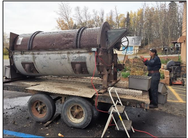
A modified carrot washer designed to clean Rhodiola roots after harvest. This washer was designed by GV Enterprises in Palmer, AK. Since the roots are intertwined creating crevices they require much more water to clean.

The grant funds allowed the District to purchase and make available three pieces of equipment during this past fall harvest of Rhodiola . These include: 1) a vegetable washer modified to clean the irregular shaped roots, 2) slicer/dicer used to slice the Rhodiola into small rounds to be dehydrated, and 3) a steel burr mill to be used to process the dried roots into either chips or a powdered form for market. The Cooperative has purchased a trailer to mount the washer on so that it can be mobile with the eventual goal of transporting the equipment to various communities during the harvest season. The equipment was staged at the Plant Material Center in Palmer, AK where members of the Rhodiola Cooperative were provided access over a 3 day time span. In all 2,500 pounds of roots were processed, resulting in approximately 550 pounds of dried and powdered product. The final product sold at $25/lb.