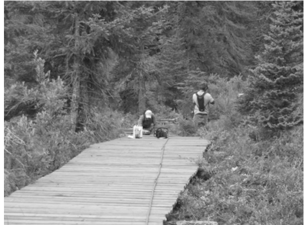
Installation of the boardwalk this past July.

An additional 943 feet of newly installed boardwalk along the Summer Trail was added to complete the 2,500 feet of boardwalk through the HDF. This project, funded by the Natural Resources Conservation Service Wildlife Habitat Incentives program, has greatly improved this summer trail, featuring a pleasant 5 km loop from the Rodgers Loop trail head. This hike will lead you through the muskeg, then upward along Diamond Creek into a meadow offering magnificent views of Kachemak Bay. After crossing the meadow the trail meanders back down along the forest on east side of the HDF and merges with the trail leading back to the trailhead. This trail offers a wonderful hike just minutes from town. Check it out!