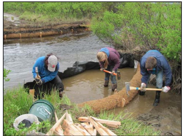
Members of the Youth Conservation Corps placing coir logs along the damaged banks. Coir logs are used for erosion control in areas of low wave energy. Overtime they will disintegrate, leaving the bank completely restored. Note the opposite bank compared to the top photo, installation is completed on that side.

The Homer District is wrapping up the year long habitat restoration project along the Watermelon trail, north of Homer. After installing a bridge last summer on the popular ATV trail in the Fritz Creek/Anchor River Critical Habitat Area the next step was to close down the in-water crossing (pictured on the left). One of the goals of this restoration effort is to re-establish the streambanks to it's natural state. This was accomplished by installing coir logs, or coconut fiber rolls, that are flexible, allowing them to mold to and protect slopes.