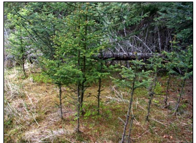
This good regeneration would benefit from thinning.

(Continued from pg 1) Landowner goals and collected information are summarized in a written Forest Stewardship Plan. These plans are designed to help landowners understand the current condition of their forestlands and what actions they might take to achieve their identified goals. These plans do not obligate the landowner to any particular actions, but landowners are asked to sign the plan to show their intention to manage their forests in ways that are consistent with the plan. Certain actions performed by the landowner may be eligible