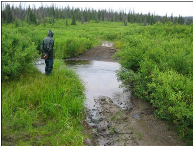
Beaver Creek prior to any restoration work. The natural stream configuration had been altered by ATV traffic, increasing the stream width and decreasing the stream depth. In-water crossings such as this can have a variety of negative impacts, including damage to natural vegetation that provides shade for streams and help regulate water temperature.

The second step is to re-establish the riparian vegetation along the damaged banks. The riparian zone, or the area beside the water's edge, is an area that divides the aquatic zone and the upland zone - but is ecologically related to both. Riparian zones serve an important function in that the vegetation filters upland run-off limiting the sedimentation that enters into the stream. With the soil disturbances from ATV use on the trails this function becomes extremely important.