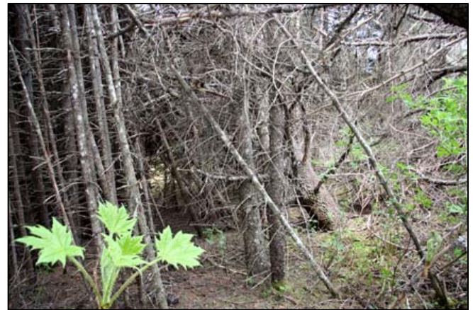
An overstocked stand with many dead trees

One of the kinds of assistance the District can provide is helping landowners learn more about their forests. Individuals with 7 or more acres of land that is forested or “capable of growing trees” are eligible for this assistance and can receive a “Forest Stewardship Plan.” Forest Stewardship Plans are provided at no cost to landowners, because we all benefit if forestlands are managed in ways that maintain or increase their long-term productivity and environmental quality.