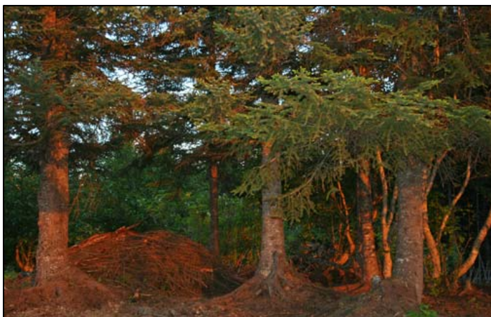
Trees thinned, lower limbs trimmed, and a brush pile for wildlife

for cost-share reimbursement. Some examples are: preparing soils for tree seeding; purchasing and planting trees for forestry or wildlife; and removing dead trees, or thinning and pruning live trees, in order to reduce wildfire hazards to homes. Contact the District for more information about Forest Stewardship Plans.